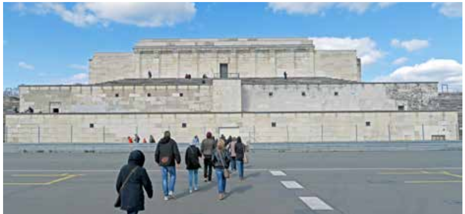
Main tribune of 'Zeppelinfeld', Nazi Party Rally Grounds.