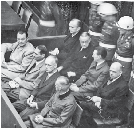
Nuremberg Trials 1945-46.

The exhibition is shown at the auditorium during the congress.